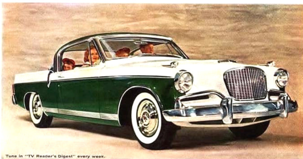
Tune in "TV Reader's Digest" every week.

At last... a real sports car that's a family car, too! 275 hp.... most power-per-pound of any American car; and there's room for five in luxurious comfort!