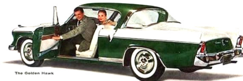
The Golden Hawk

At last... a real sports car that's a family car, too! 275 hp.... most power-per-pound of any American car; and there's room for five in luxurious comfort!