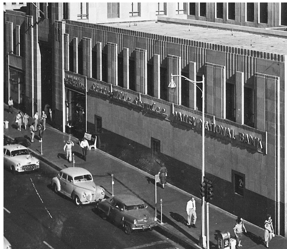
Studebaker in 1950s Phoenix. See page 14 for more Studes in '50s Phoenix.