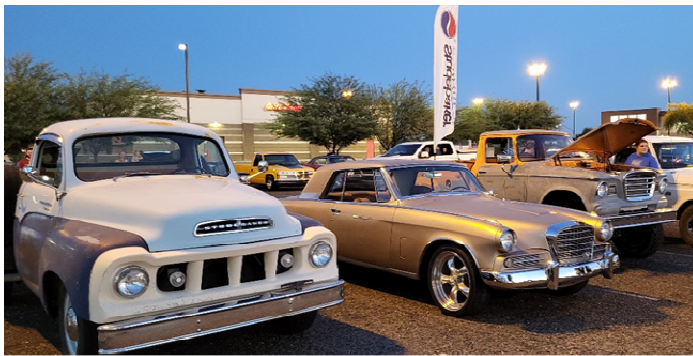
On the left are members' Studes at Mixteca's.