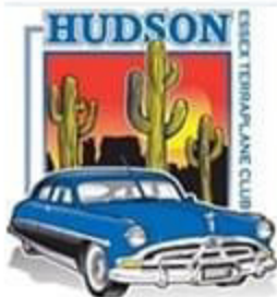
Grand Canyon Chapter

*There will be NO Food Vendors at the Car Show.*