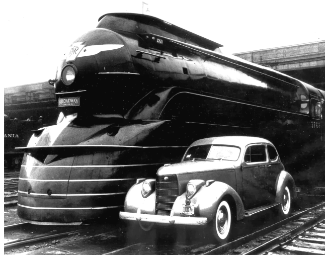
Studebaker President with another Raymond Loewy design, the Pennsylvania Railroad Broadway Limited's locomotive. This view shows the headlamps lurking behind boat-prow shaped glass covers.