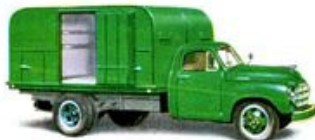
1 1/2-ton shown with insulated milk body—2-ton also available