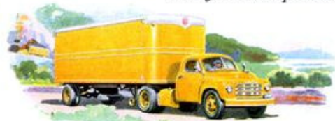
2-ton tractor shown with 26-foot semi-trailer