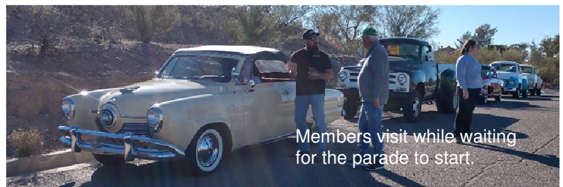
Members visit while waiting for the parade to start.