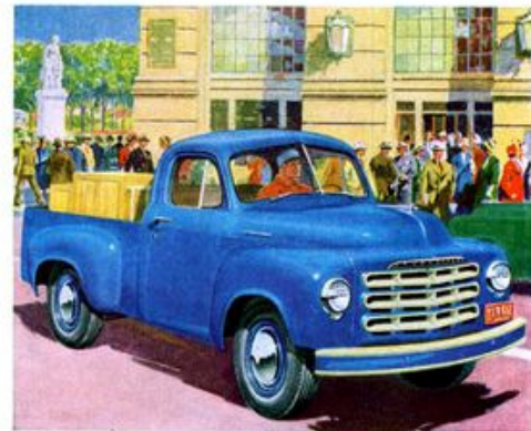
1 1/2-ton 6-foot pick-up—also available with 6 1/2-foot stake body

A new Studebaker truck is like a savings bank on wheels!