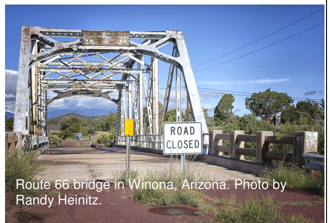
Route 66 bridge in Winona, Arizona.