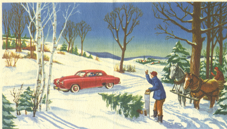
Studebaker - The Finest Now

And all good wishes for your health, happiness and good fortune in the New Year