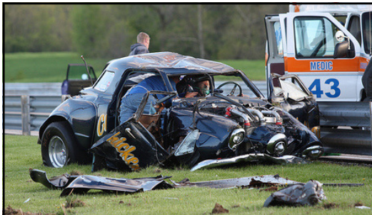
The Chicken Hawk after the crash.

You can send well-wishes to Ted at tedharbit@aol.com or 18994 North 125 East, Summitville IN 46070-9113