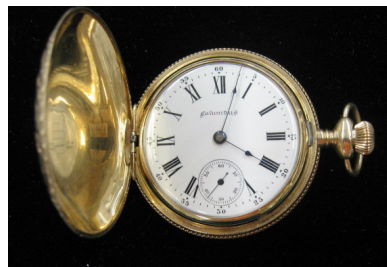
An example of a Columbus Watch Company pocket watch from a recent eBay auction.