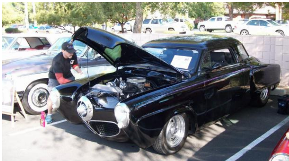
1950 Starlight Coupe owned by Ralph Guariglia.