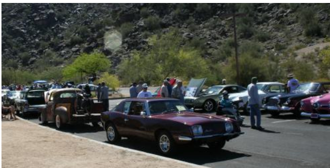
Two views of the cars and crowds at March Madness, the All Arizona Gathering held at South Mountain Park, March 28th.