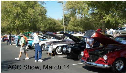
AGC Show, March 14.