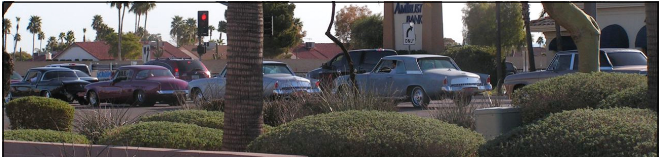
Keeping the streets of Wickenburg beautiful.

Visit the Chapter web site at http://www.grandcanyonsdc.com