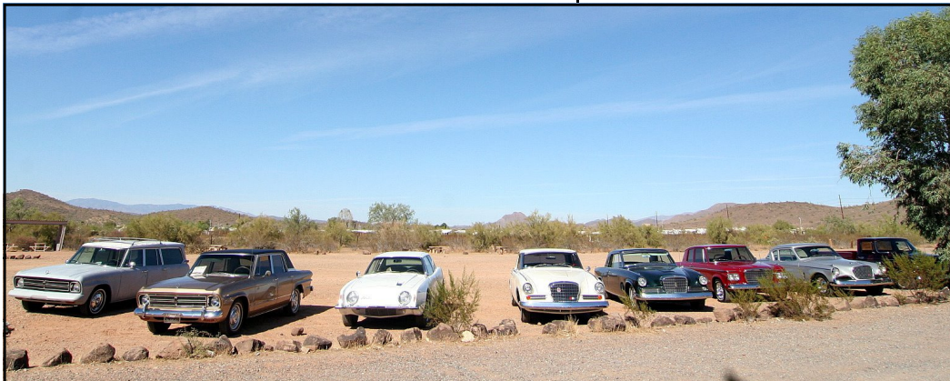
Left to right: 1964 Wagonaire 1966 Cruiser 1963 Avanti 1963 GT Hawk 1964 GT Hawk 1963 Lark 1958 Hawk 1963 Champ