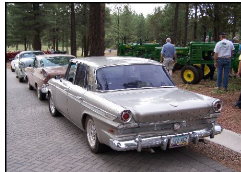
Studebakers and John Deere tractors.

You can read more history about the Clarke Floor Machine Company at the web site of the modern company manufacturing Clarke sanders, edgers, buffers, vacuums and other equipment - http://www.americansanders.com/AboutClarke/History.aspx