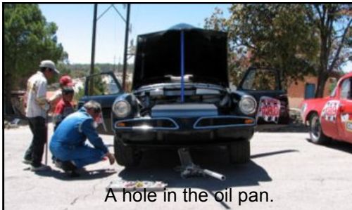
A hole in the oil pan.