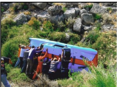
One of the Studebakers in the race took an off-road excursion.

Editor's Note: Bill is a Phoenix resident who has participated in many motorsports events. You can read more about the race here: http://www.chihuahuaexpress.com/