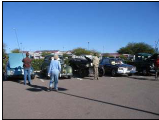
Above: Photos of Winter Studebaker Celebration on January 19, 2008 at Arizona Golf Resort.