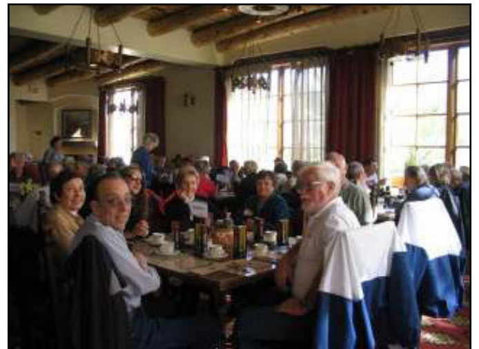
Above: Photos of Southern Arizona Chapter's Annual Banquet, January 20, 2008 at Tanque Verde Guest Ranch, Tucson.