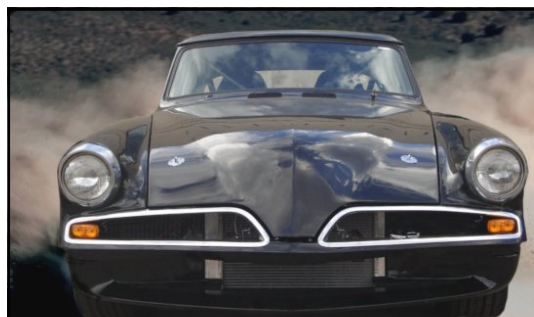
A 1954 coupe modified for the Panamericana La Carrera race. Good or bad?

Editor's note: Do you agree with Ernie? Totally? Somewhat? Not at all? Are young people concerned only with comfort and performance? What do you think about the number of custom and modified vehicles showing up at the international meets? Have original Studebakers been relegated to being trailer queens or museum stock? Your comments are welcome.