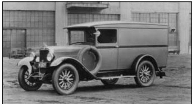
Rare Erskine panel truck.

http://members.tripod.com/~erskine_registry/erskine.html http://www.erskinclan.com/car.html