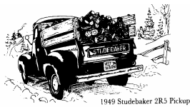
1949 Studebaker 2R5 Pickup