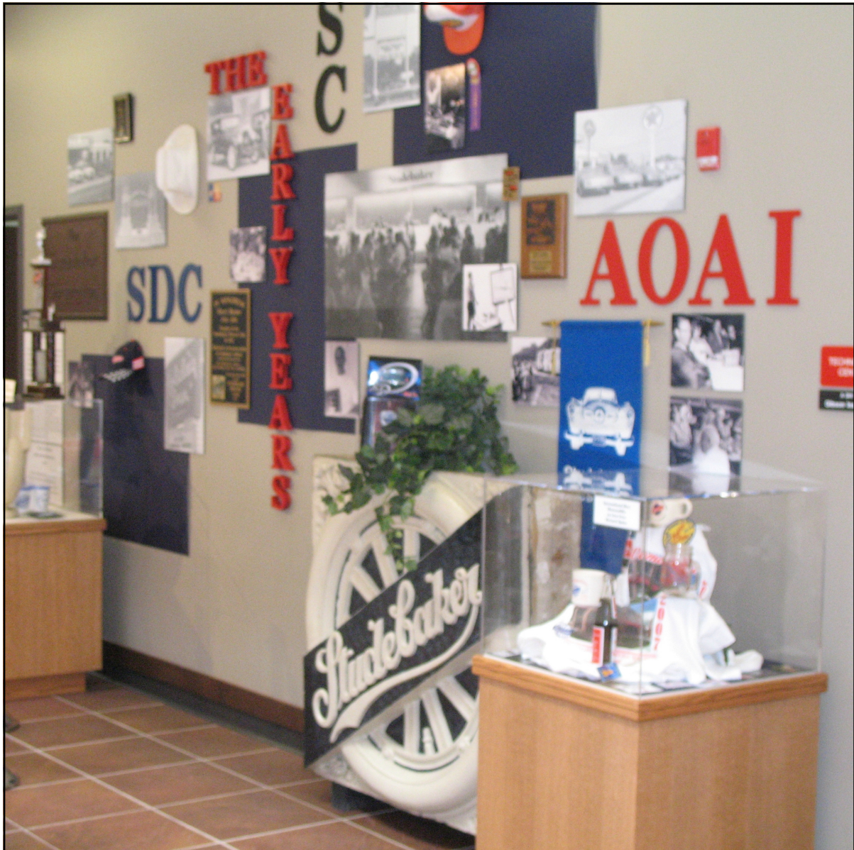
Terra Cotta Wheel