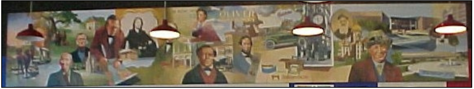
Post Office Mural